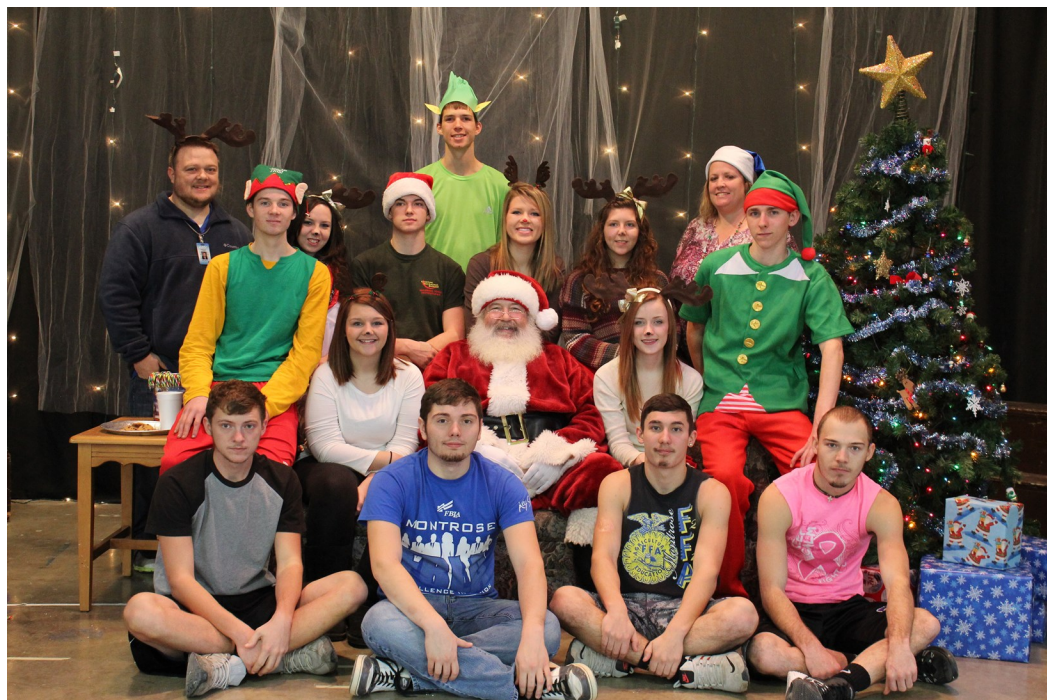
Christmas fun with Santa, hosted by the Senior Class of 2015. From top left to bottom right—Kindergarten, 1st & 2nd, 3rd & 4th, 5th & 6th, 7th, 8th, 9th, 10th, 11th, and Seniors 2015!